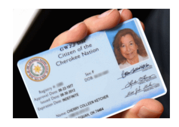
1. Tribal Identification Card